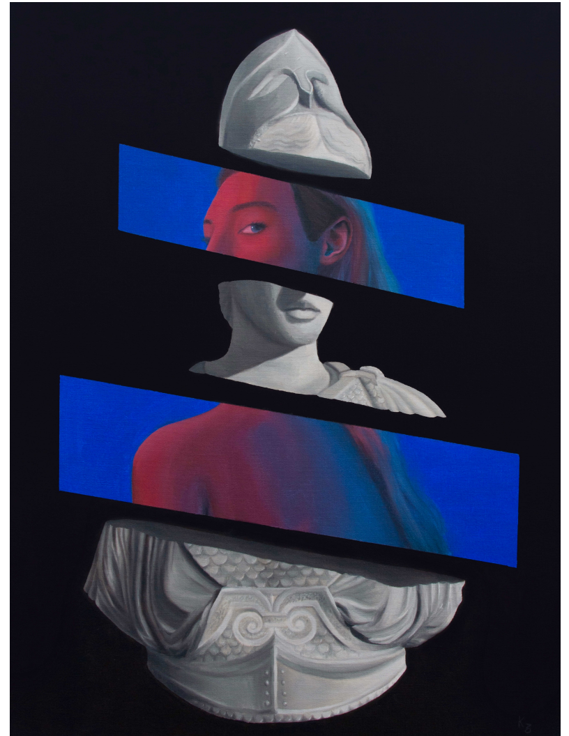
Armure, oil painting on linen canvas, 60x80 cm, 2022