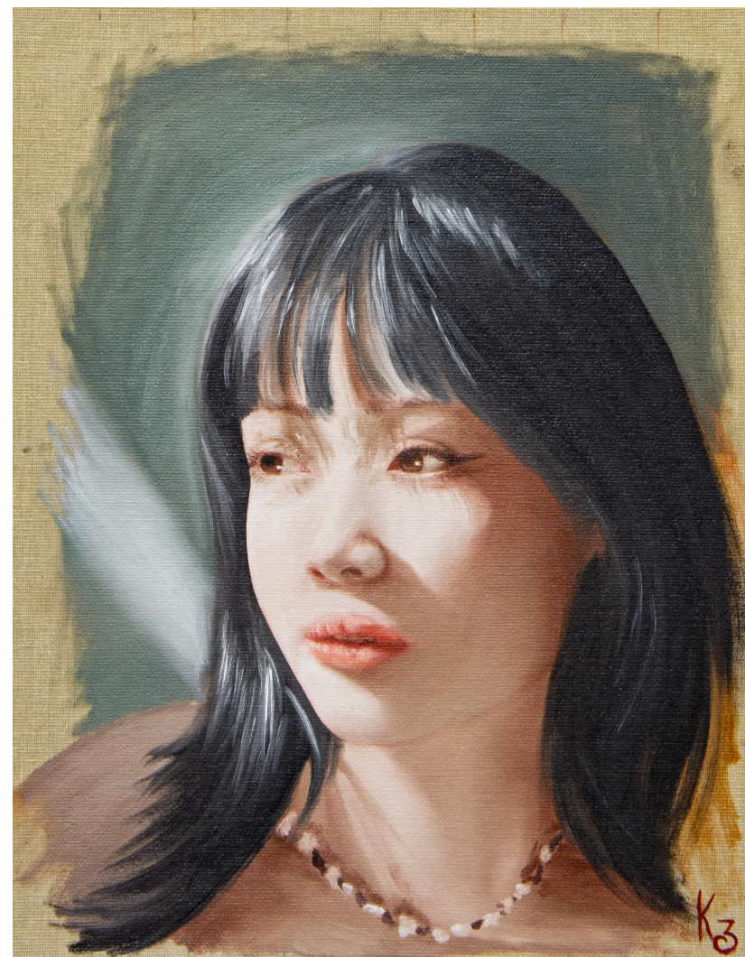
Nami, oil painting on panel, 24x30 cm, 2024