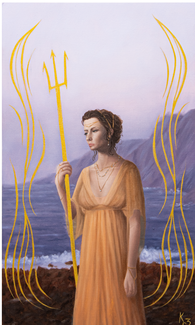
Amphitrite, oil painting on wood, 30x50 cm, 2024