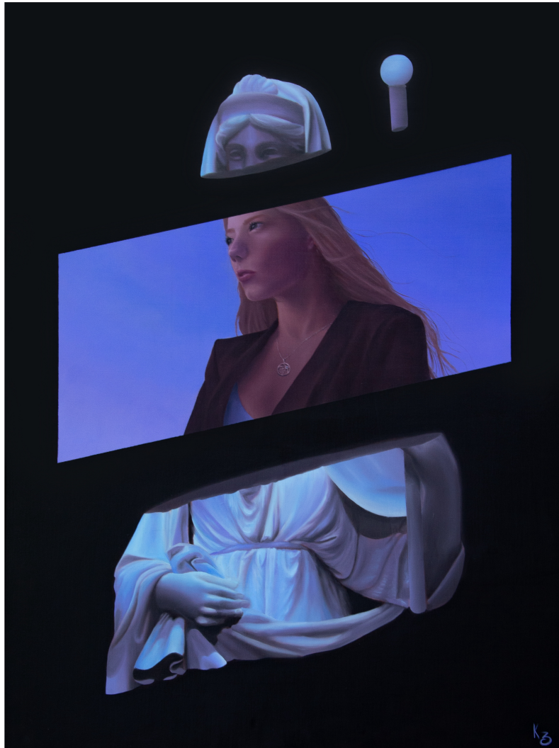
Vesta, oil painting on wood, 60x80 cm, 2023